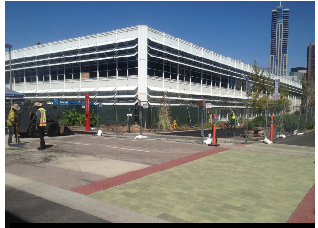
UNIVERSITY OF COLORADO; DENVER, BOULDER, MINES